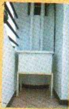
External split unit